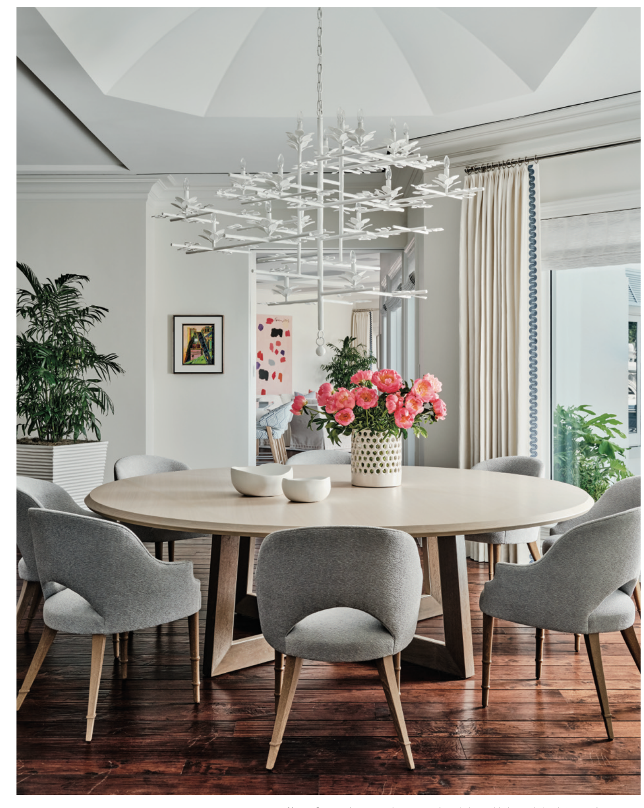
Above: Quintus chairs encircle a custom Joseph Jeup table beneath the dining area's statement Paul Ferrante chandelier. Framing the floor-to-ceiling window are draperies made of a Clarence House fabric with a blue Travers trim.

Opposite: A Günther Förg artwork enlivens the family room alongside a Cameron Collection sofa and armchairs. The mahogany side table supporting a Hamilton lamp joins a Bradley coffee and side table on the Abrash Galleries rug. Rogers & Goffigon mohair cloaks the ottomans.