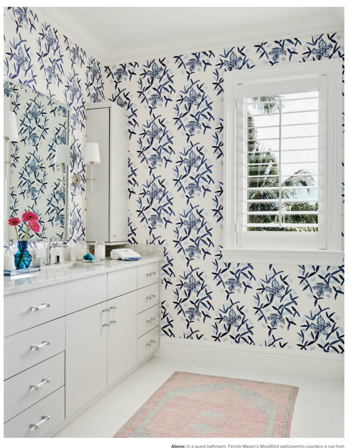
Above: In a guest bathroom, Ferrick Mason's Woodford wallcovering counters a rug from Interior Resources. Top Knobs hardware and Waterworks sconces shine in the space.

Opposite: Phillip Jeffries wallpapers adorn the ceiling and walls of the husband's office, home to a Hickory Chair desk and armchair, which wears a Kravet velvet. An Eames chair and a Visual Comfort & Co. lamp outfit the workspace.